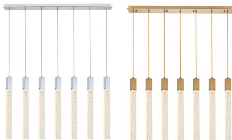
Chrome Item No: 2066S42C